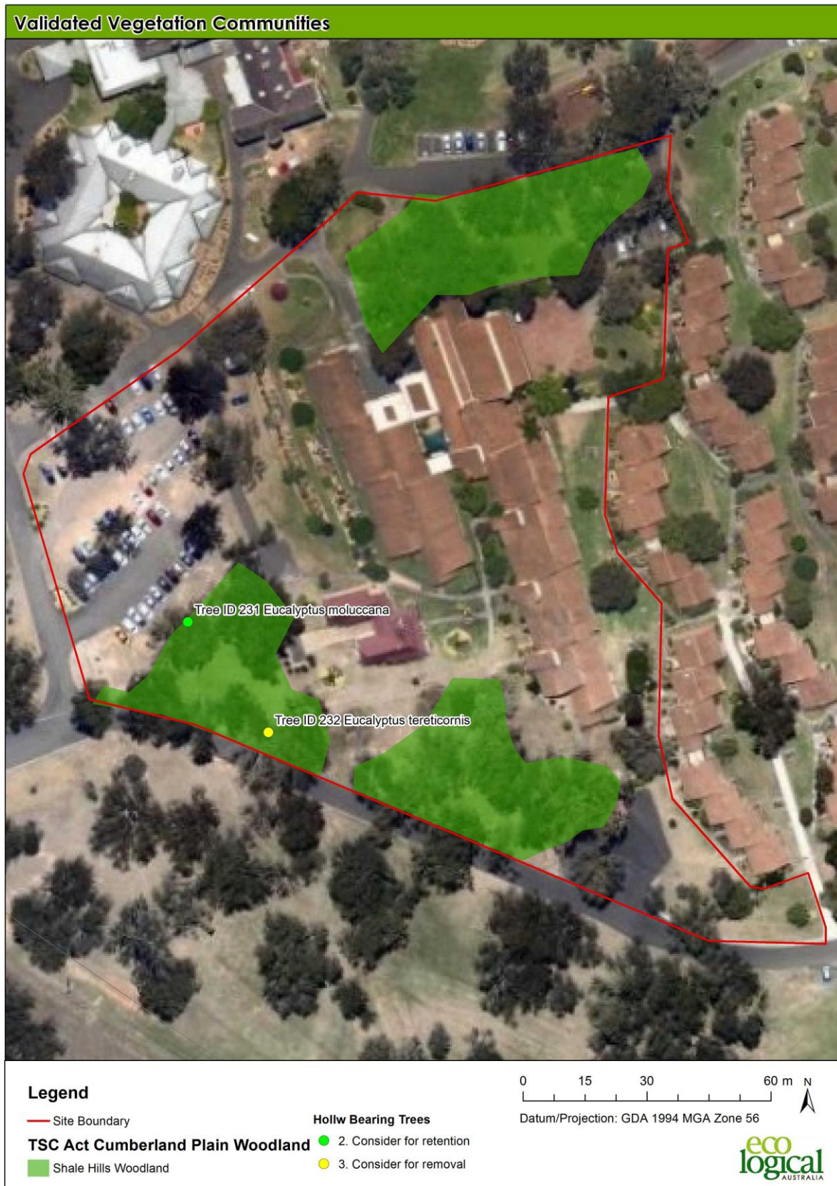
Figure 1. Vegetation Communities and Hollow Bearing Tree Locations